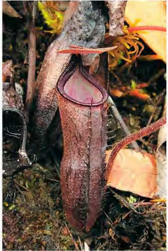
Figure 2: The lower pitchers of N. alba – note the typical purple colouration.

The exterior and interior of the upper pitchers is predominantly white in colour, although the bottom half of the trap may suffuse yellowish green towards the base. Red or pink blotches and flecks are usually present either on the interior or exterior of the upper pitchers (or on both surfaces) although the extent and density of this colouration is extremely variable (see below). The